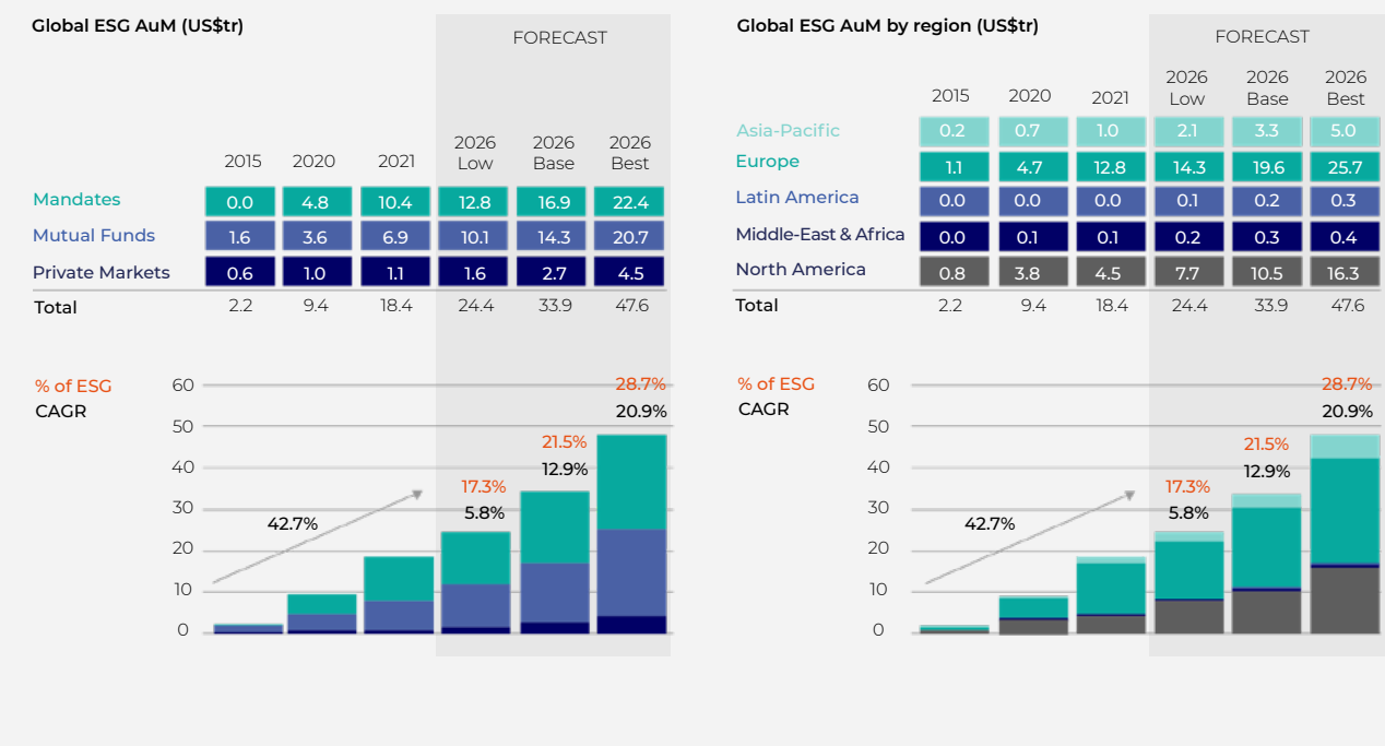
FIGURE 2 AWM growth in ESG investments (PwC)